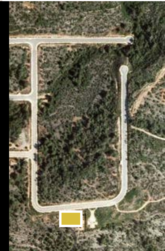
Eco and green start-ups