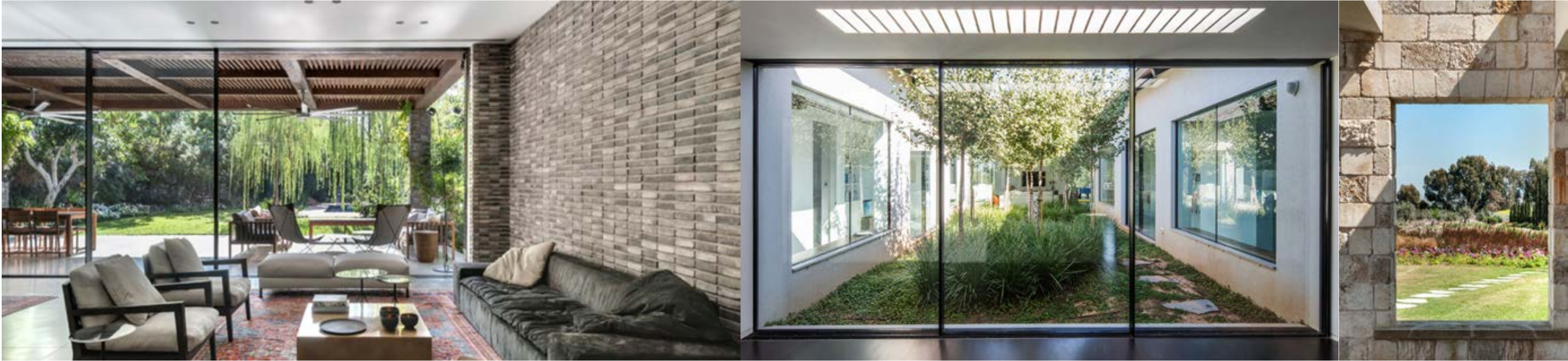
Patios offer privacy and constant contact with the natural environment

The Huella Verde Mallorca settlement offers you more than a place to live, each of its 114 units will reflect sustainable construction, water integration, food and energy systems under one roof. Each unit will be designed and built according to sustainable living including size, orientation, energy consumption, wind direction and gardening – from ornamental plants and flowers to fruits and vegetables.